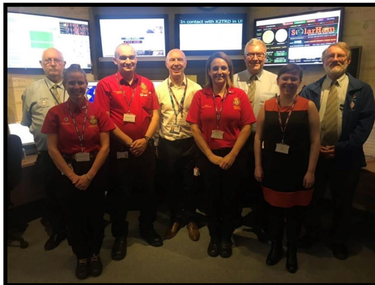
The CFRs, together with representatives from NHS Improvement and operatives from the National Radio Centre

The team were able to speak with contacts in the United States, Moldova and Israel as well as to a crew flying in a Boeing 737 in the skies whilst enroute to Albania.